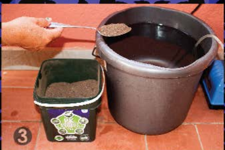
and 1 tablespoon (15 gr.) of the PK BOOSTER COMPOST-TEE mixture