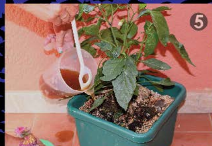
Pour the tea on the soil within 4 hours after the tea is ready. Use half a litre of tea per plant.