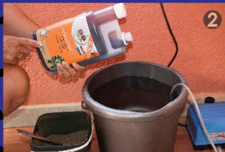
Add per litre of water (chlorine-free and at room temperature): 5ml of ORGATREX