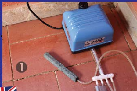
Aeration stone and aquarium pump for sale at www.biotabs.nl