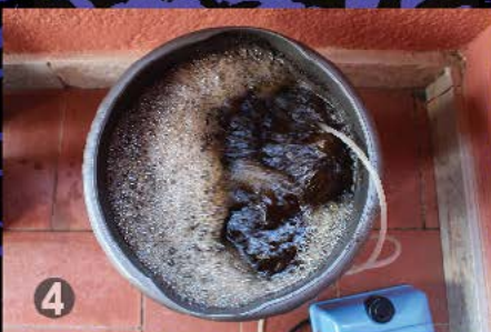
Leave to bubble for 24-36 hours.